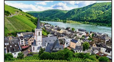
The Rhine Valley