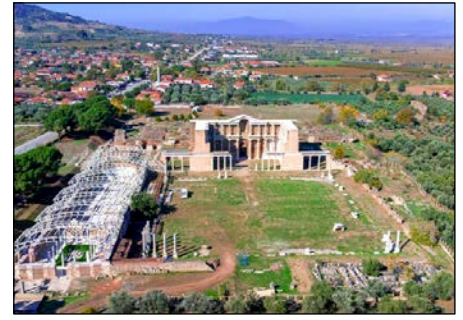
The Temple of Artemis at Sardis