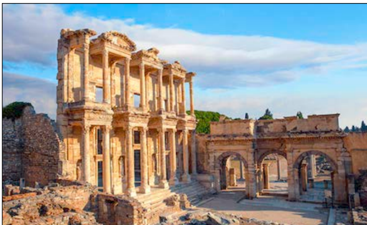
Ephesus with its famous Library and where Paul ministered from for 2-3 yrs