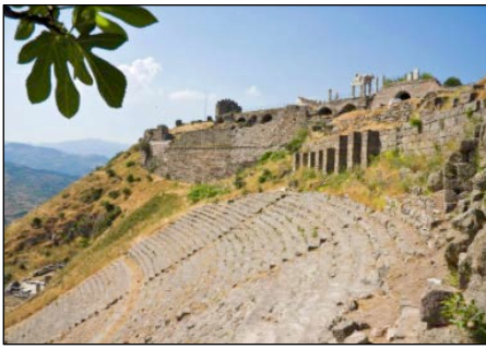
The Acropolis of Pergamum