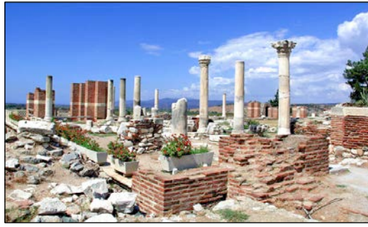
Basilica of St. John in Ephesus