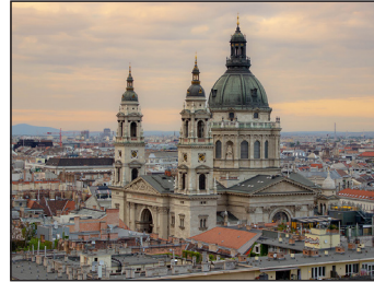
St. Stephen's Basilica, Budapest