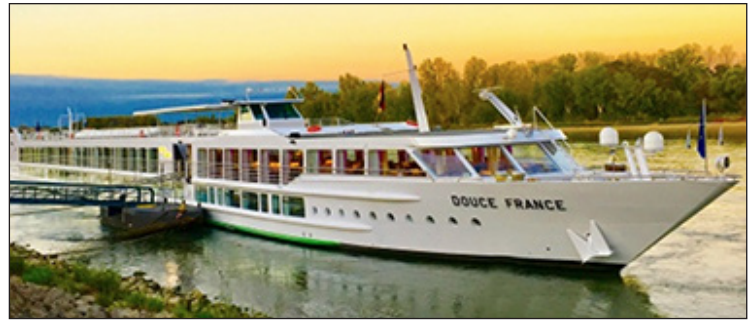
MS Douce France