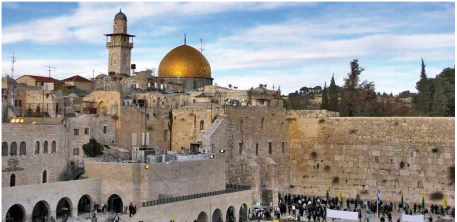
Old City, Jerusalem