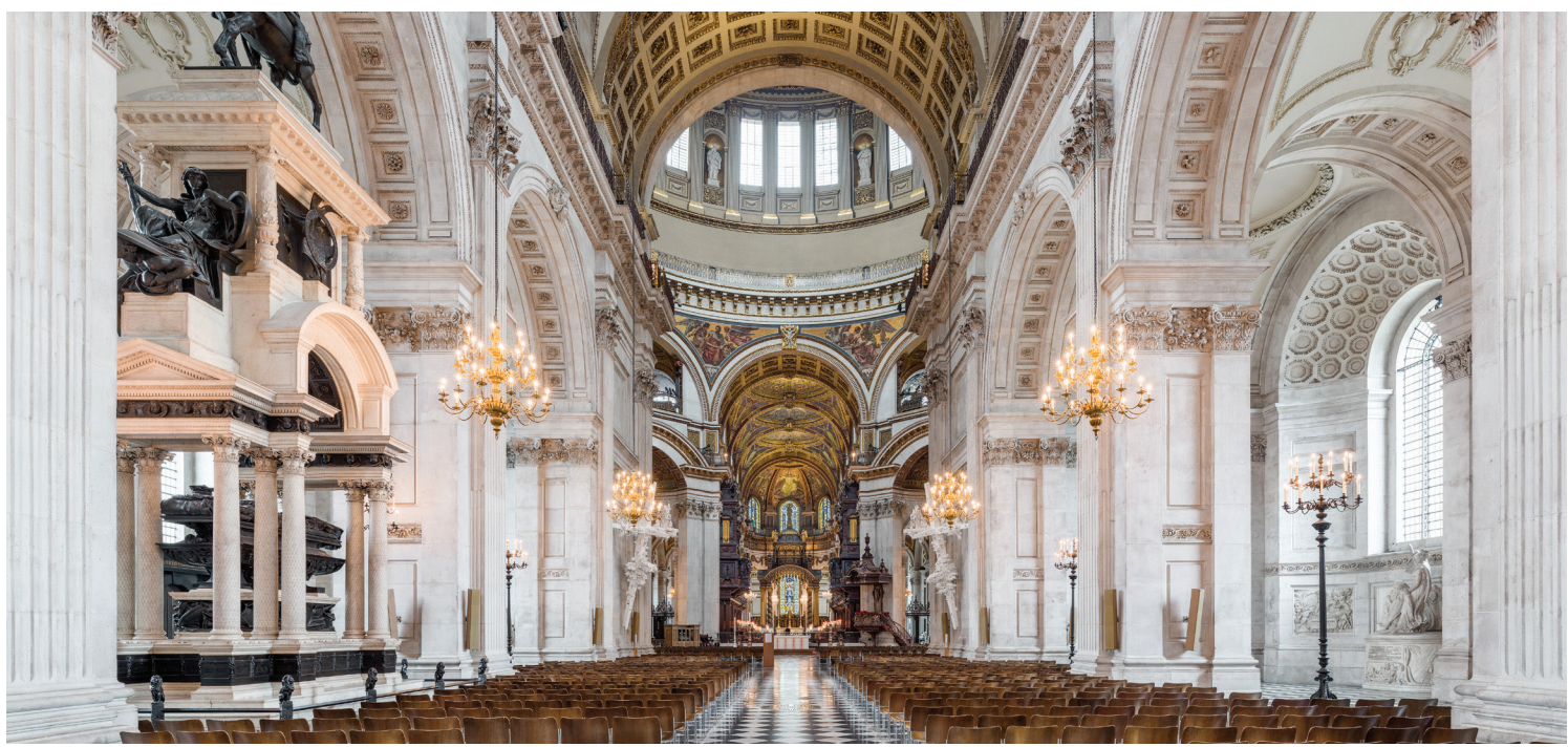
St. Paul's Cathedral, London

London • Canterbury • Salisbury Area • Swindon • Oxford • Cambridge • York