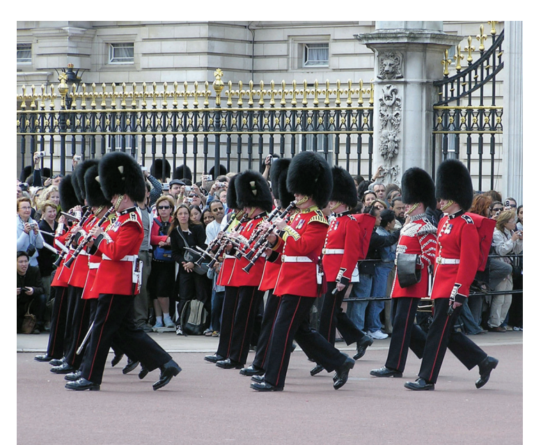
Changing of the Guard